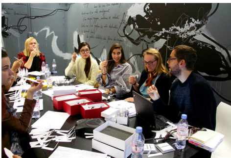
Takasago Project, 2017

Those with degrees in the performing arts and design are the most likely ever to be employed as professional artists, with 82 percent of dance, theater and music performance majors, and 81 percent of design majors working as professional artists at some point. (Source: Inside Higher Ed)