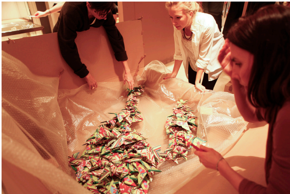
Hermes window display, corporate partner project year

Students begin preparing for their careers the day they select the university at which they will study art and design. To further our mission to guide promising students into becoming professional artists, art historians, designers and design managers, the Career Development Office offers students the professional tools required to complement their creative skills as they enter the job market as young artists and designers.