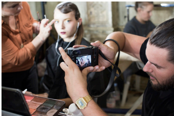
Tsumori Chisato Projet, 2016