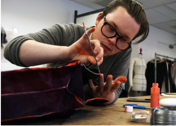
Compagnons Du Devoir Project, 2016