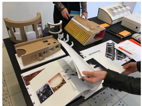
Erotokritos Projet, 2017