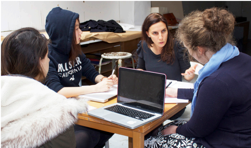
Resume Workshop at Paris College