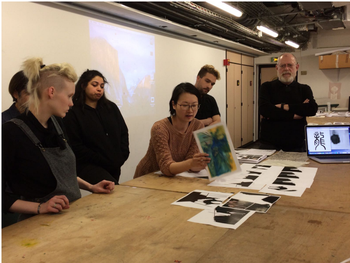
Aubusson Projet, 2017